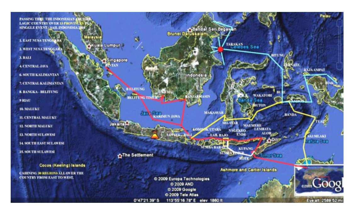
Fig 2. Indonesian waters are a playing ground for the Yacht Race

Recent rapid development in particular islands provides additional attractions. This is especially observed in islands that are targeted for tourism development. For instance, the development of the Mandalika resort in the Lombok Islands with numerous tourists as a world-class facility. The development of Labuan Bajo becomes a crucial key to the potential massive tourist arrivals in Nusa Tenggara. Nusa Tenggara recently became the favorite for nature and culture-based tourism destinations. These developments demonstrate serious consequences, including an increase of tourist numbers in limited areas, changes of environmental problems, and potential socio-economic problems. In other words, opportunities exist for disease spread. Tourist behaviors are frequently identified as contributing to the spread of disease, especially HIV/AIDS (Wright, 2003; Santos & Paiva, 2007).